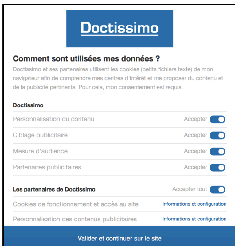
Figure 2 - Extended cookie banner on doctissimo.fr after clicking on the cookie parameters link

The website does not offer a clear option to reject consent and the cookie banner disappears the moment the user takes any action on the site (such as scrolling). The cookie banner merely notifies the user that data might be shared with third parties for “analytics, content personalisation, sharing on social network, audience measurement, profiling and targeted advertising”.